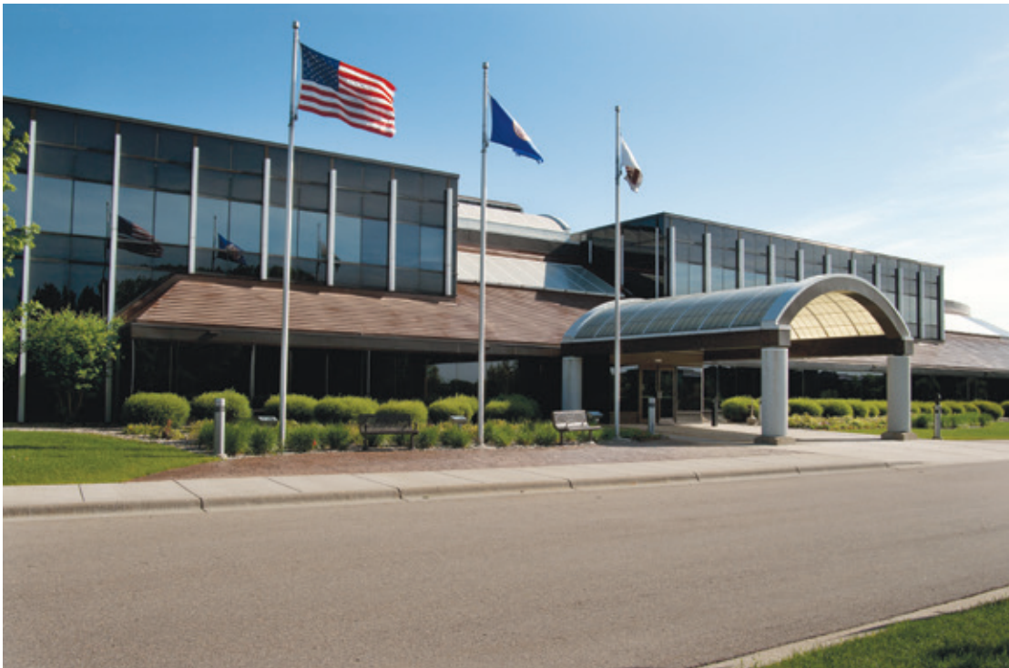
MTS Systems Corporation

The servohydraulic load frames that form the core of the 815 and 816 systems are the result of a world-class industrial design program. No matter which system fits your needs best, you can expect to perform rock mechanics tests safely and efficiently in a tightly controlled environment that emphasizes precision as well as easy operation.