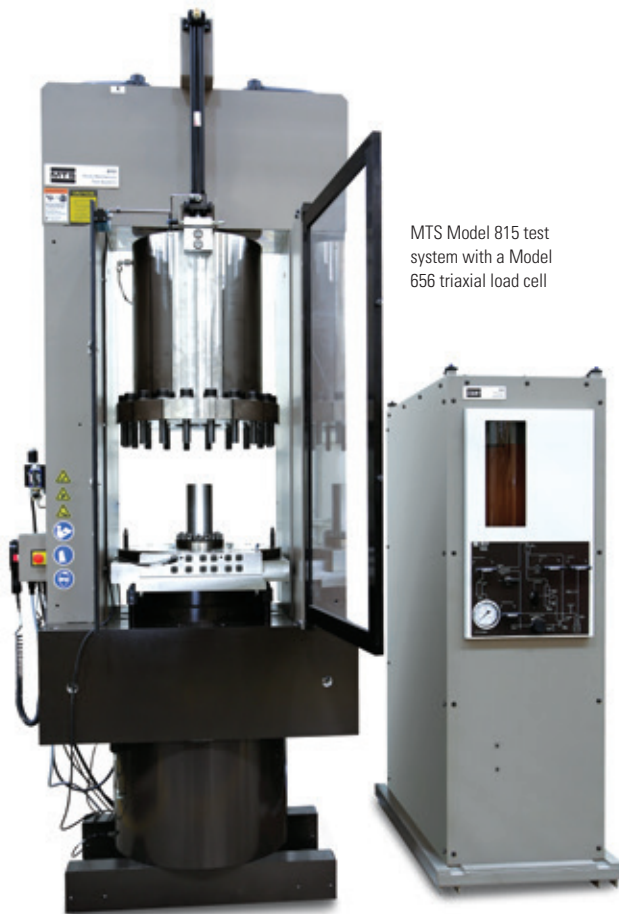
MTS Model 815 test system with a Model 656 triaxial load cell

The MTS Model 815 and 816 test systems include a number of features that help test professionals perform a wider variety of tests with a single system. Spacer plates allow you to choose from a range of specimen sizes. Load frames are pre-engineered for installation of triaxial cells. Other accessories are designed for easy installation in multiple configurations, depending on your needs. Plus, MTS can customize either system to accommodate unique requirements.