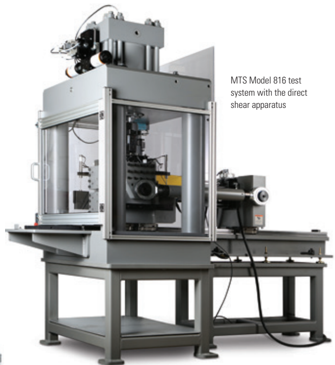
MTS Model 816 test system with the direct shear apparatus